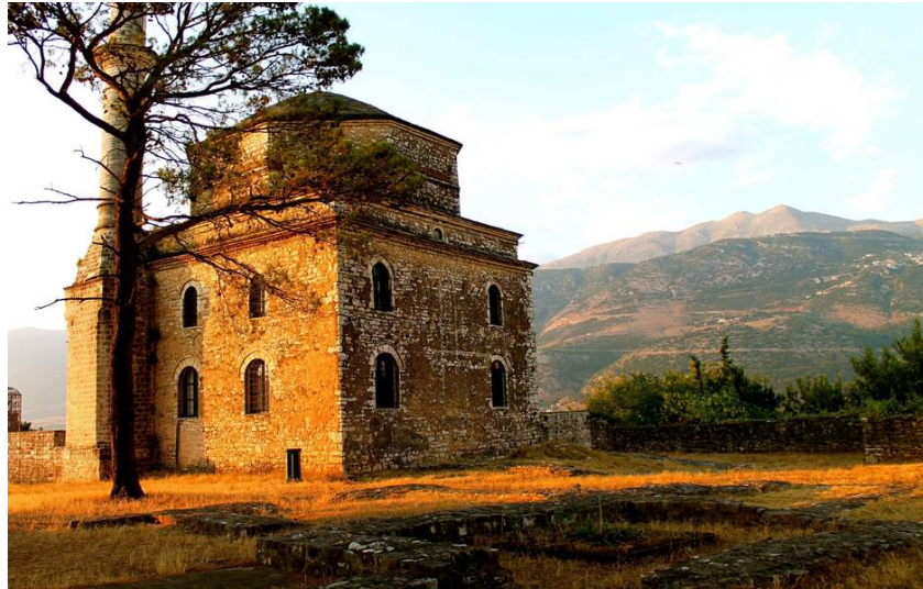
The Fethiye Mosque, pictured, is the burial place of former Ottoman ruler Ali Pasha.