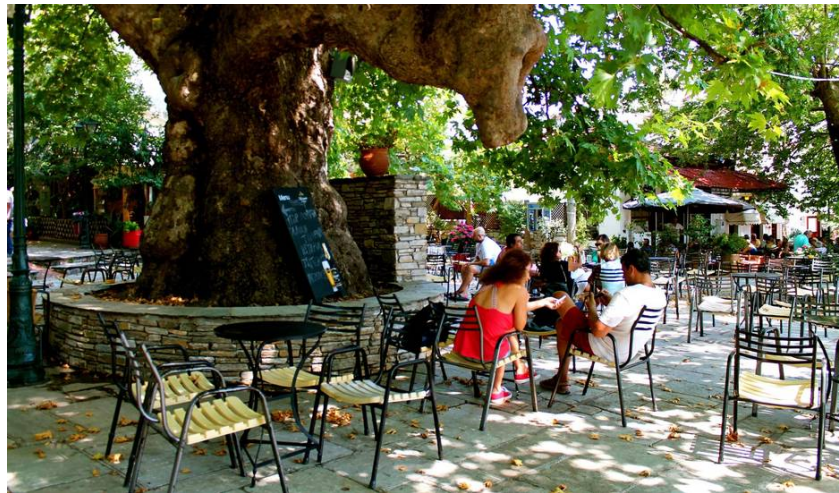
A typical Pelion square in Portaria. (Elizabeth Warkentin)