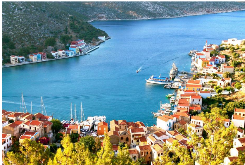
It's hard not to feel excited upon docking among the brightly coloured neoclassical buildings lining the horseshoe-shaped harbour of Kastellorizo.