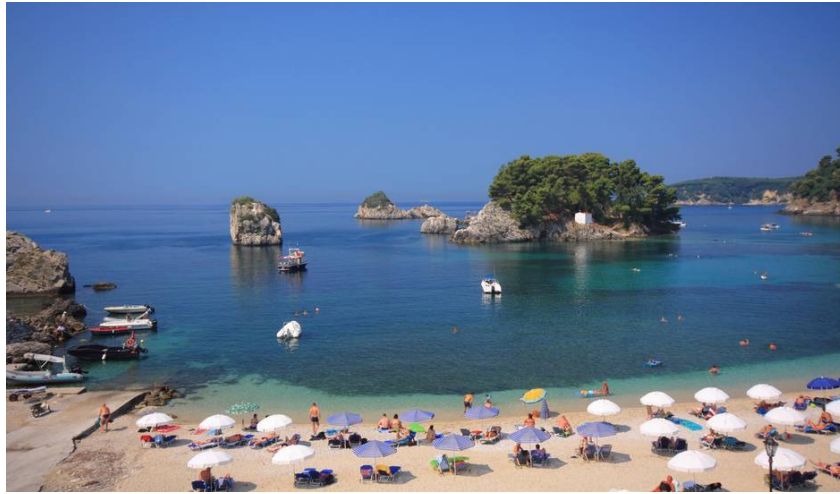
Parga, in the Epirus region of Greece.