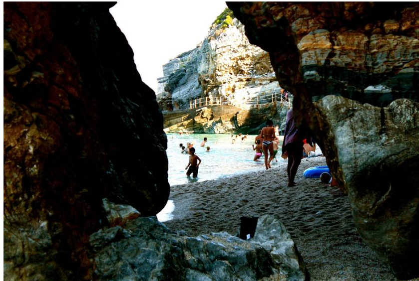
The Mylopotamos beach on the Pelion peninsula. (Elizabeth Warkentin)

Vertiginous mountain roads offering sweeping views of the sea are interrupted by villages typified by leafy, sun-dappled squares and half-timbered houses, many often adorned with overhanging balconies and the ubiquitous vidrio , or stained-glass, windows.