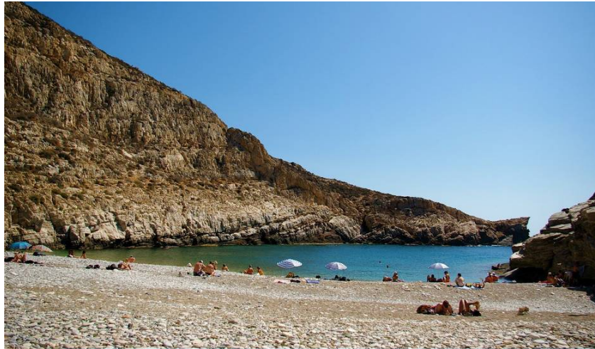
This September 2008 photo shows Livadaki beach, a splendid pebble and stone beach on Folegandros, a Greek island in the Aegean Sea.