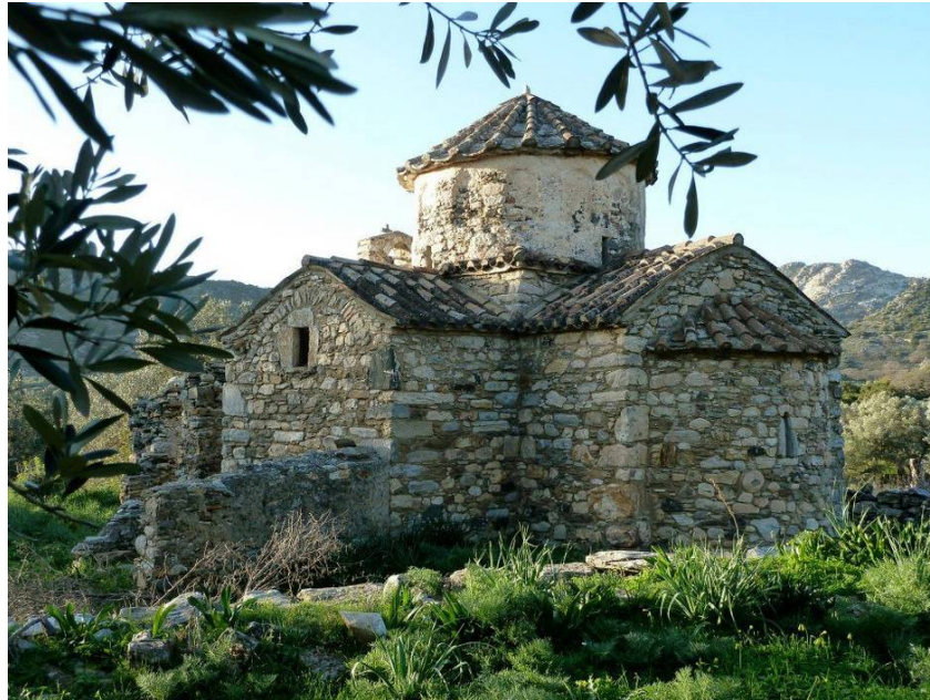
The Church of Panagia Damiotissa in the Tragheia region of Naxos (Alexander Reichardt)

village, visit the Fish & Olive art gallery ( fish-olive-creations.com ) and sample kitron , the local liqueur made of citron, which resembles a large, carbuncled lemon or grapefruit, at the Vallindras Distillery ( www.greeka.com ) right across from Fish & Olive.